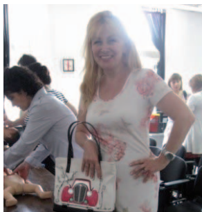
Prof Dusica Simic (Serbia)

Also, The Committee for Paediatric Anaesthesia in close collaboration with Education Committee launched Regional Training Centre for Paediatric Anaesthesia in Belgrade, for anaesthesiologists from former Yugoslavia, former SSSR, Middle East and North Africa. We are offering three modules (cardiac anaesthesia, paediatric intensive care and regional anaesthesia and pain therapy. First two months are dedicated to the basics of paediatric and neonatal anaesthesia in every module.